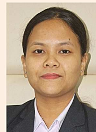
Student ID : 2020TM11 Hometown : Titabar

Background : B.A. in Geography Contact No. : +91 8011601788 Hometown : Badarpur Town, Kalairbond Road, District Karimganj Email : chaitika24@gmail.com