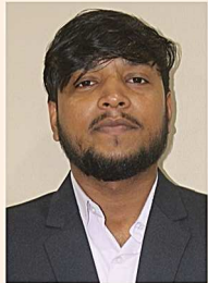
Student ID : 2020TM14 Hometown : Golaghat