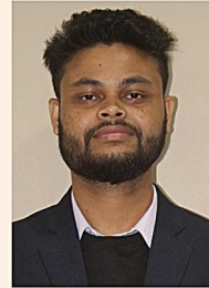
Student ID : 2020TM15 Hometown : Naharkatia