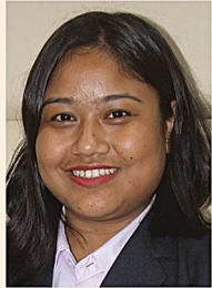
Student ID : 2020TM07 Hometown : Tinsukia