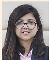
Student ID : 2020MF08 Hometown : Tezpur