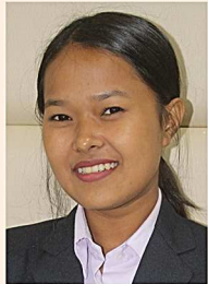
Student ID : 2020TM03 Hometown : Doomdooma

Background : B.A. (History) Internship : CN Travels Contact No. : +91 8011651694 Email : supriyasekharan4@gmail.com