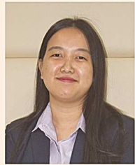
Student ID : 2020MF01 Hometown : Naharkatia