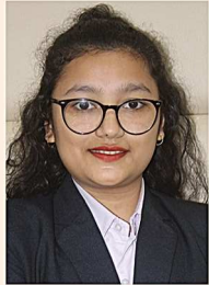
Student ID : 2020TM09 Hometown : Golaghat