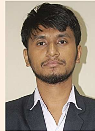
Student ID : 2020TM21 Hometown : Sivasagar