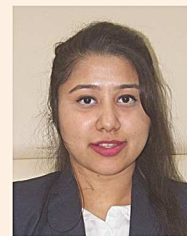
Student ID : 2020MF10 Hometown : Dibrugarh