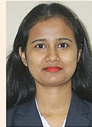
Student ID : 2020TM06 Hometown : Dergaon

Background : B. Com, (Accounting and Finance) Internship : CN Travels Contact No. : +91 7637969803 Email : kajoldihingia@gmail.com