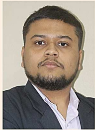
Student ID : 2020TM19 Hometown : Jorhat