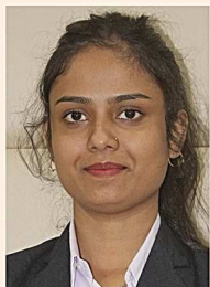
Student ID : 2020TM01 Hometown : Karimganj

Background : B.A. in English Internship : CN Travels Contact No. : +91 6003889619 Email : duttanisharani1999@gmail.com