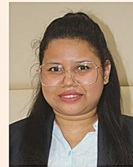
Student ID : 2020MF06 Hometown : Namrup