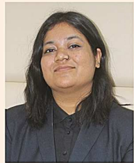
Student ID : 2020MF04 Hometown : Bokakhat