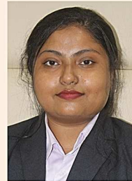
Student ID : 2020TM12 Hometown : Tezpur

Background : B.Com (Marketing) Internship : CN Travels Contact No. : +91 9101175491 Email : rajashreekonwar123@gmail.com