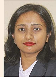
Student ID : 2020TM13 Hometown : Sonari

Background : B.Sc. (Physics) Internship : CN Travels Contact No. : +91 7002659784 Email : madhurjyajyotideka97@gmail.com