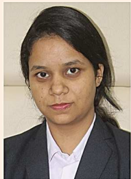
Student ID : 2020TM04 Hometown : Bokakhat