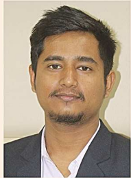
Student ID : 2020TM17 Hometown : Dergaon