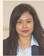
Student ID : 2020MF03 Hometown : Guwahati