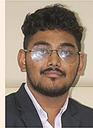
Student ID : 2020TM18 Hometown : Tezpur

Background : B.A. (Sociology) Internship : Cozy Tour & Travels Contact No. : +91 8822131395 Email : prarthanabrahma18@gmail.com