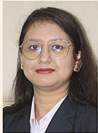
Student ID : 2020TM08 Hometown : Sivsagar

Background : B.A. Internship : CN Travels Contact No. : +91 7896501386 Email : rohitsaha2505@gmail.com