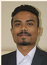
Student ID : 2020TM22 Hometown : Lakhimpur

Background : B.A. Internship : CN Travels Contact No. : +91 9127447640 Email : chakrabortysudipta135@gmail.com