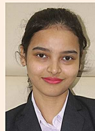
Student ID : 2020TM05 Hometown : Gohpur

Background : B.Sc. (Economics) Internship : CN Travels Contact No. : +91 9101104748 Email : tridevsaikia2000@gmail.com