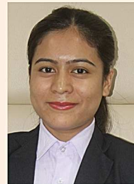
Student ID : 2020TM10 Hometown : Pasighat