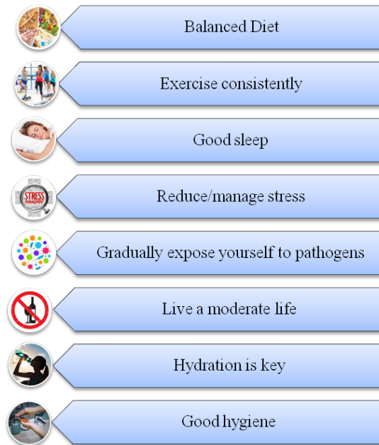
Fig 3: Strategies to boost immunity

The strategies to boost immunity are described below and mentioned in Fig 3.