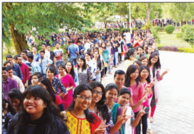
Students participating in the DUPGSU Election 2015