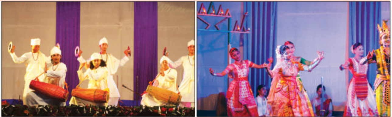
Scenes from the play Parijat Haran performed by Students of Dr. Bhupen Hazarika Centre for Studies in Performing Arts