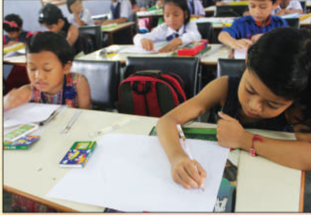
Art Competition for school children organised by DU Officer's Association