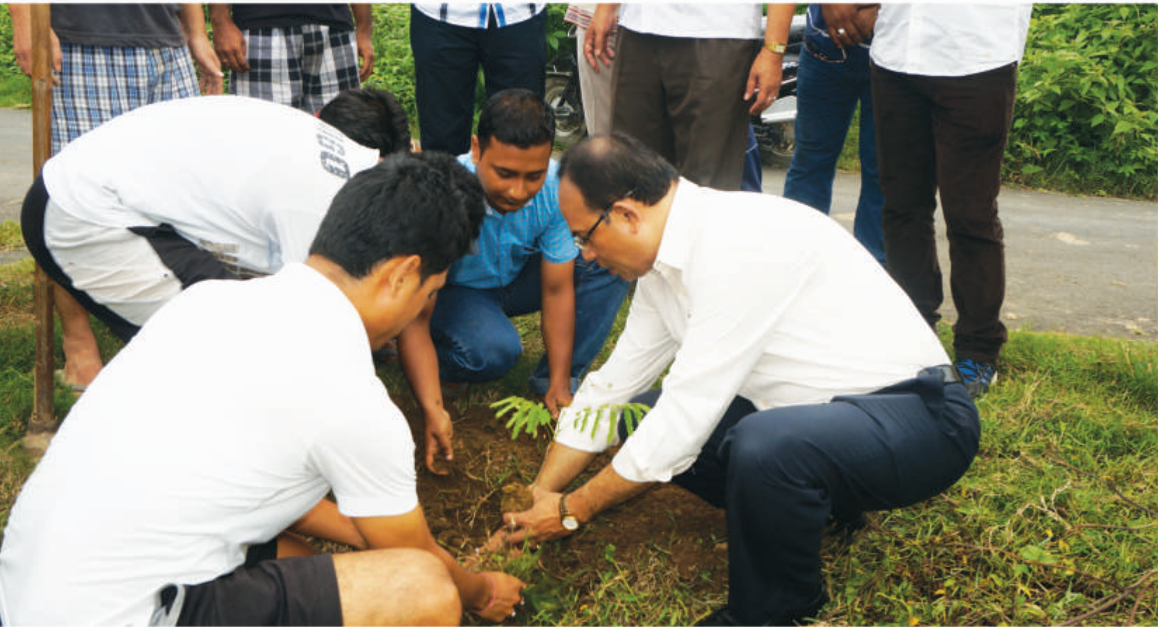
Plantation Drive undertaken by DURSA on the World Environment Day