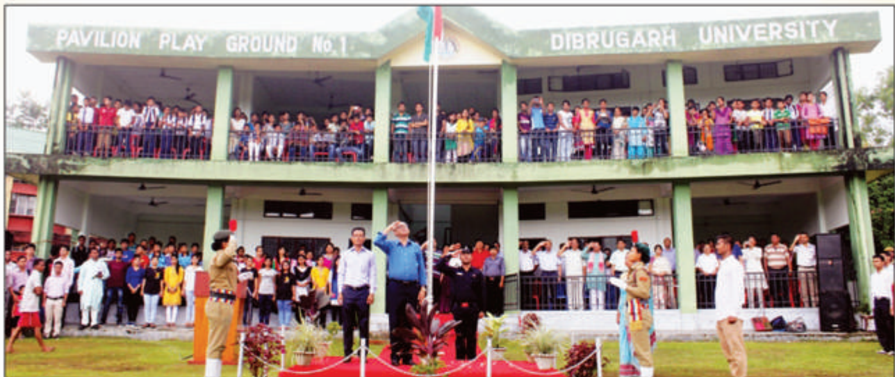
The Vice-Chancellor hoisting the National Tricolour on the 69 th Independence Day Celebrations