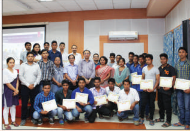
Certificates distributed to College drop-outs after the end of the Technical Workshop conducted under the Associated Village Programme