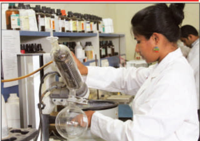
Students from the Department of Chemistry conducting Laboratory Assignments