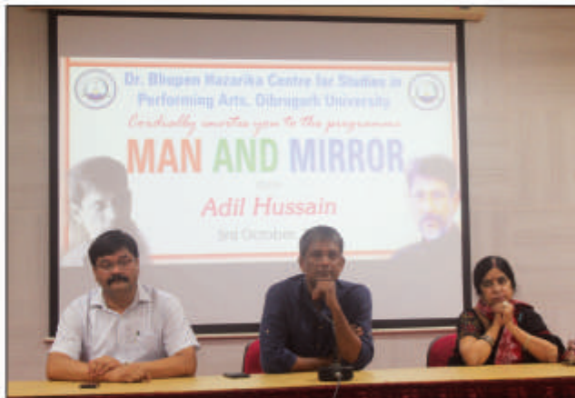
Noted Character Actor Adil Hussain interacting with the DU fraternity