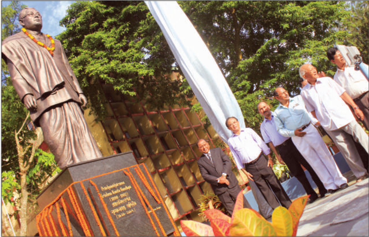
Unveiling the statue of Prachyavidyarnava Krishna Kanta Handique during the Closing Ceremony of Year long Golden Jubilee Celebrations of the University