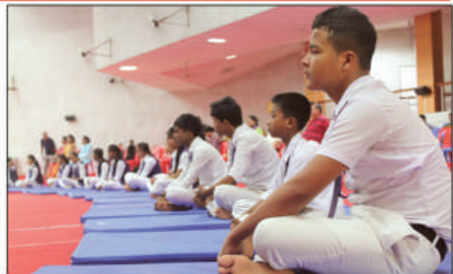
NSS Cell of DU observing International Day of Yoga on June 21 st 2015