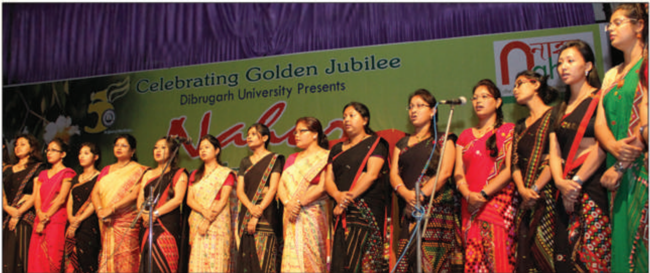
Students wearing colourful attire during Nahor , the Inter University Meet 2015