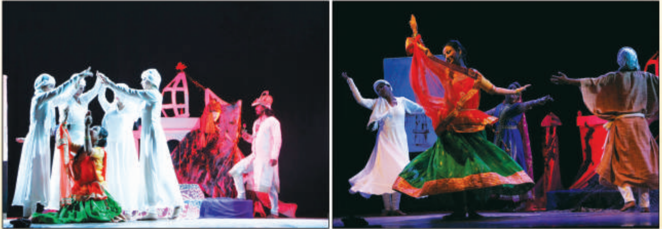
Students and Research Scholars of the Department of Education performing Pranjal Buragohain's play Taj Mahal