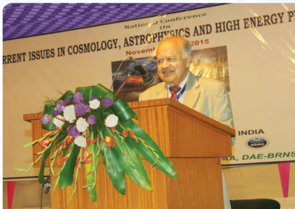
World Renowned Astrophysicist Professor Jayant Vishnu Narlikar in Dibrugarh University

The Biannual Newsfeed of Dibrugarh University