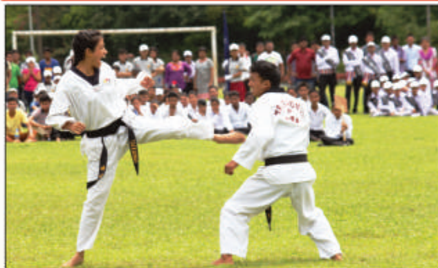
Students exhibiting their Martial Arts skills as part of a programme held to commemorate the 69 th Independence Day